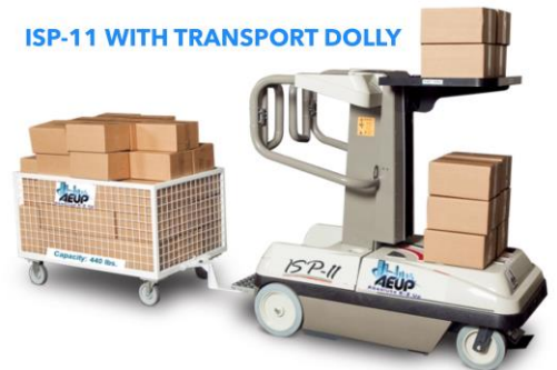
ISP-11 WITH TRANSPORT DOLLY

Once again, Absolute E-Z Up® leads the way with safe, practical and innovative solution that reduces both time and labor, WHILE increasing productivity returns.